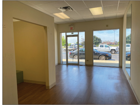
Suite 184 - Former John's Tailor Shop - 793 SF