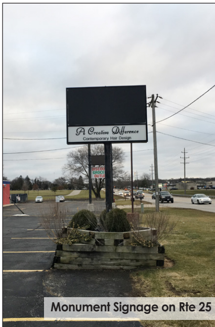
Monument Signage on Rte 25