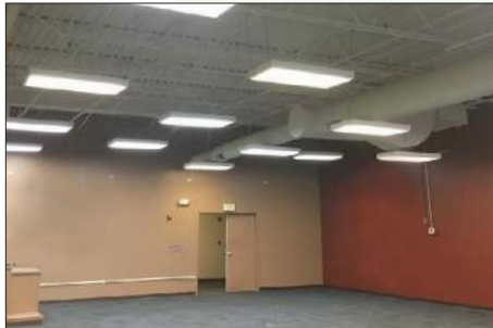
1517 - Inline Space