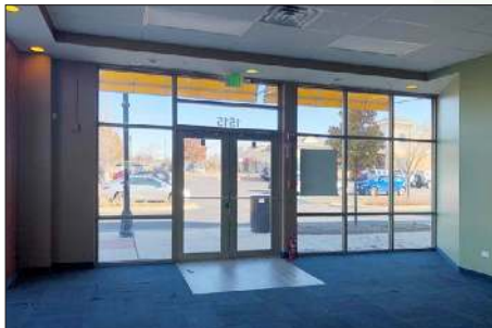
1515 - End Cap Space