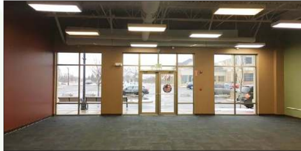
1517 - Inline Space