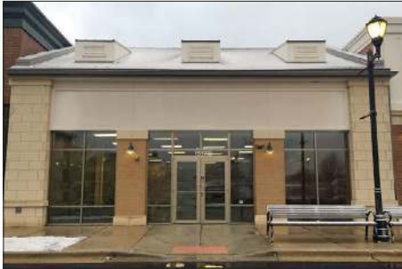
1517 - Inline Space

Join Best Buy, La-Z Boy, PotBelly, Athletico, JoAnn's, Fox River Spa WonderPlay & Cafe, and Sapporo Tanoshii Sushi