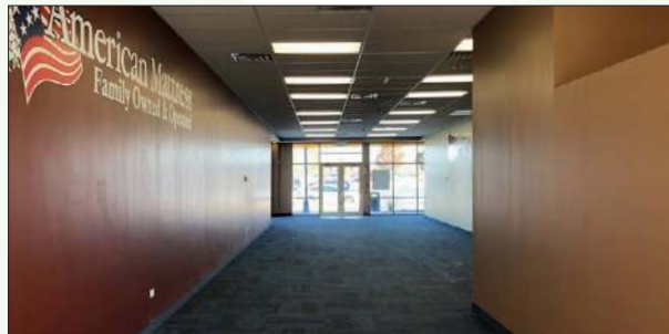
1515 - End Cap Space